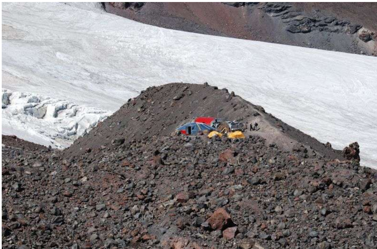
North Hut 3760m

Day 3. Acclimatization climb to North Hut 3760m. Descent to Hathansu Base Camp.