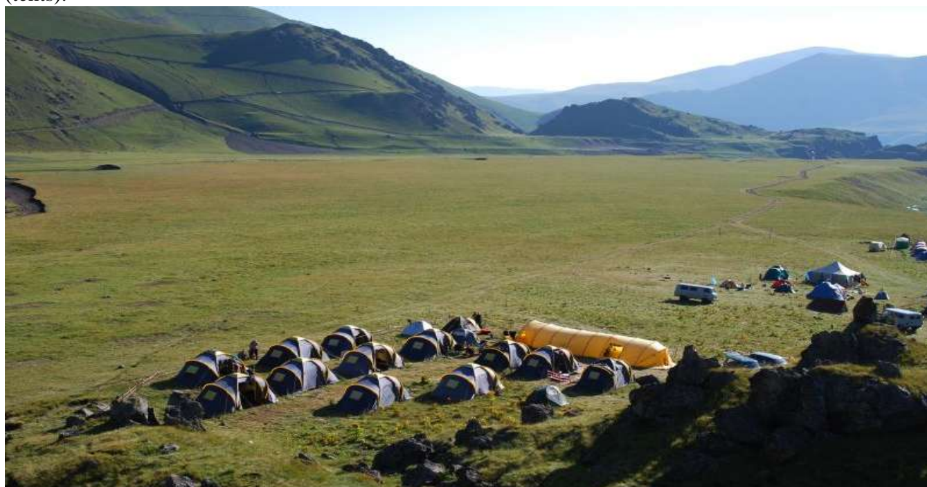
Hathansu Base Camp 2500m

Day 2. Transfer to Hathansu meadow 2500m, 100km, along the Malka river valley. Hathansu Base Camp (tents).