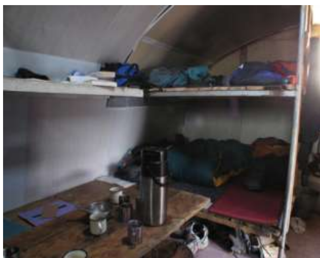
North Hut 3760m

Day 4. Hike to the North Hut 3760m. Check in to the hut.