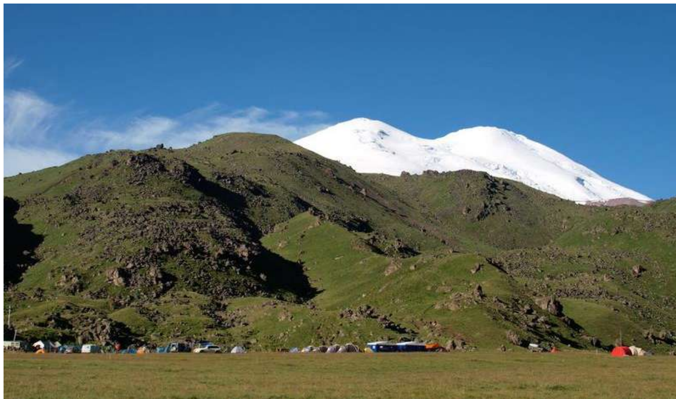
Hathansu Base Camp 2500m

Program: 2013: 08 – 16 June; 27 July – 04 August